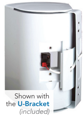
Shown with the U-Bracket (included)