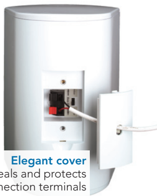
Elegant cover conceals and protects connection terminals

IO-805: Enclosure 10-5/8" W x 13-3/4" H x 10-5/8" D mounting bracket increases depth 1-1/4"