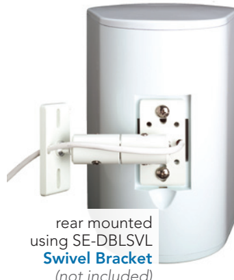
rear mounted using SE-DBLSVL Swivel Bracket (not included)