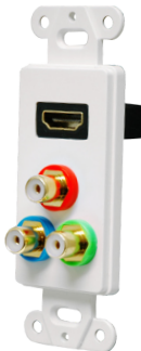
IW-HDMI 31 (shown populated)

3 Conductor Mini with Solder back with black insulator