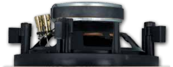
Side-View of Frameless Grille