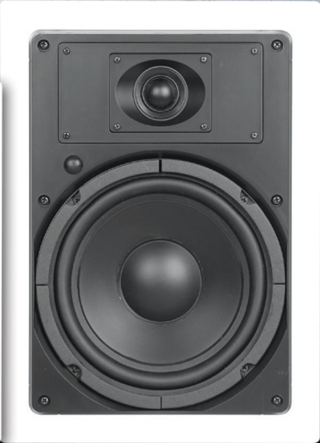
SE-691E 5-1/4" In-Wall 2-way Loudspeaker