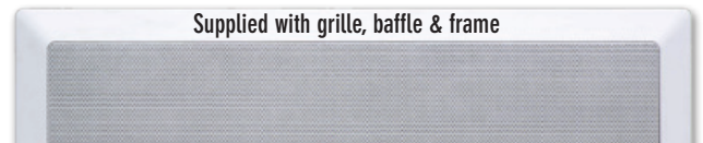
Supplied with grille, baffle & frame